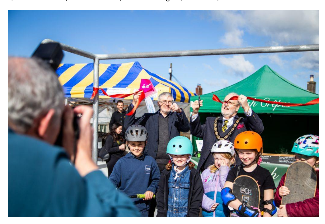
"The Town Council took over responsibility for the skate park back in 2017 when the Youth Club closed. The park was in very poor condition and shortly after taking it over we were advised to close it as it was deemed unsafe and the site almost derelict. The Town Council took the decision to rejuvenate the park and fast forward five years to today. It's not been a straightforward journey but here we are with a state-of-the-art facility that we can all be proud of. Inevitably given the challenges we have all faced over the past couple of years there are still some finishing touches to make."